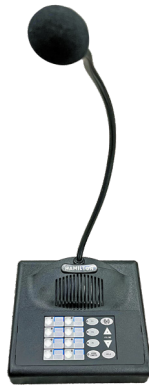
5701-8 Series Audio Console