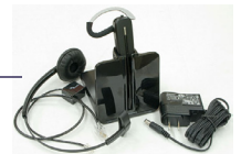
CS-540 Wireless Headset