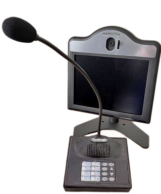
Model 5701-8 Teller Video

Anywhere drive-up or walk-up business takes place Hamilton audio/video equipment will help keep lines moving by providing clear communications between you and your customers. Whether it's business at a drive-up window or the need to complete transactions from a remote location, we have the solution.