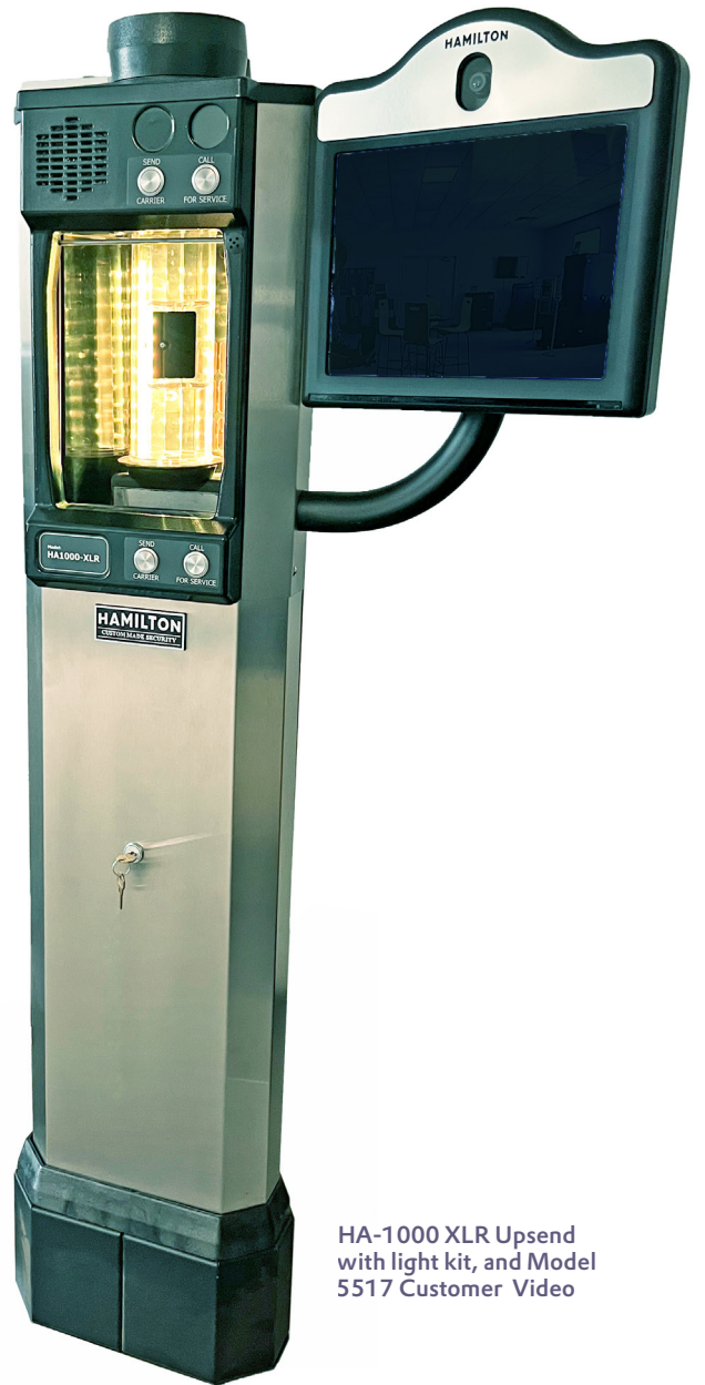
HA-1000 XLR Upsend with light kit, and Model 5517 Customer Video