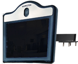
Model 5517 Customer Video